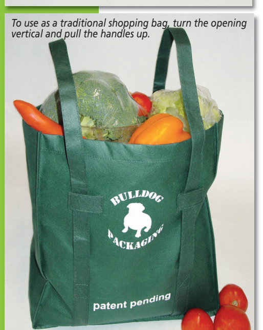
Patent Pending No. 61/893,303

800.392.5464 | www.bulldogpackaging.net FREE SAMPLES | FREE CATALOGS