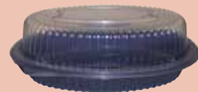
M1180D + LH1180D