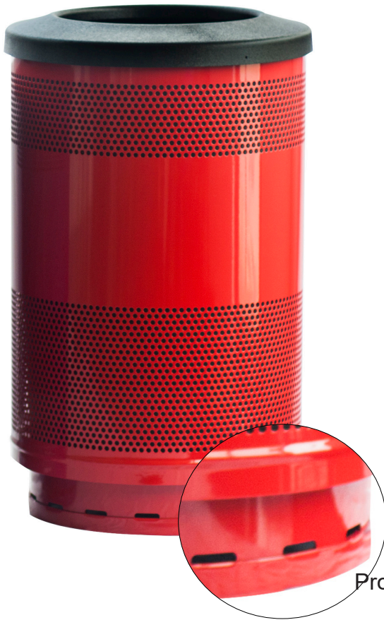
Protective Coated Base