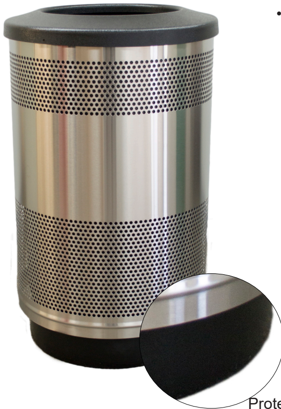
Protective Coated Base