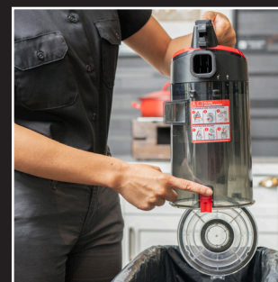
EASY-EMPTY DUST CUP