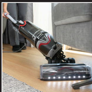
MANEUVERABILITY LED LIGHTS