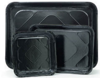
BLACK ELEGANCE BAKEWARE