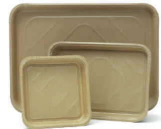
KRAFT NATURAL BAKEWARE