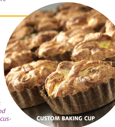
CUSTOM BAKING CUP

• CUSTOM MATERIALS: Need a tray that can handle 10 pounds of chicken wings? No problem. Need more release for your brownie batter after baking? No problem. Need a custom printed tray with your logo to enhance your brand image? No problem. The SOLUT! process combines a variety of paperboard materials and functional coatings to achieve the look, cost, and performance for your specific application. Call us with your requirements, and we'll create a custom solution that works!