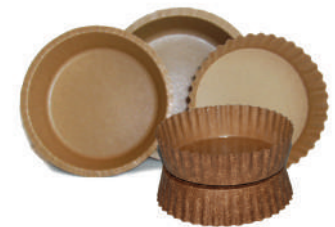
ROUND AND FLUTED CUPS

SOLUT! bakeware is a cost-effective and sustainable alternative to CPET, foil, and metal trays. For use in conventional or micro-wave ovens, our unique thermoformed paper trays and cups are strong and versatile, and can be customized to your exact needs.