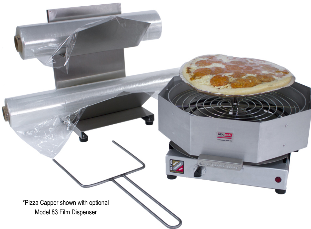
*Pizza Capper shown with optional Model 83 Film Dispenser

READ ALL INSTRUCTIONS CAREFULLY BEFORE OPERATING EQUIPMENT