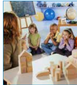
Schools and Daycare