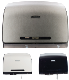
Mod* Coreless JRT Jr. Dispensers