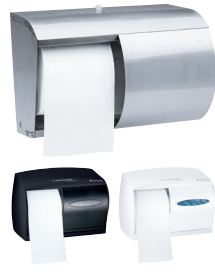
Coreless Double Roll Dispensers