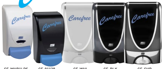
CF-WHB1LDS CF-91128 CF-WHI CF-BLK CF-CHR