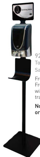
92752 Touch-Free Sanitizing Station

Free-standing Touch-Free Dispenser unit with sign and catch tray included.