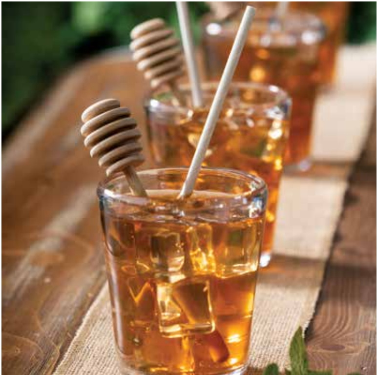
7.75" White Bar Stir