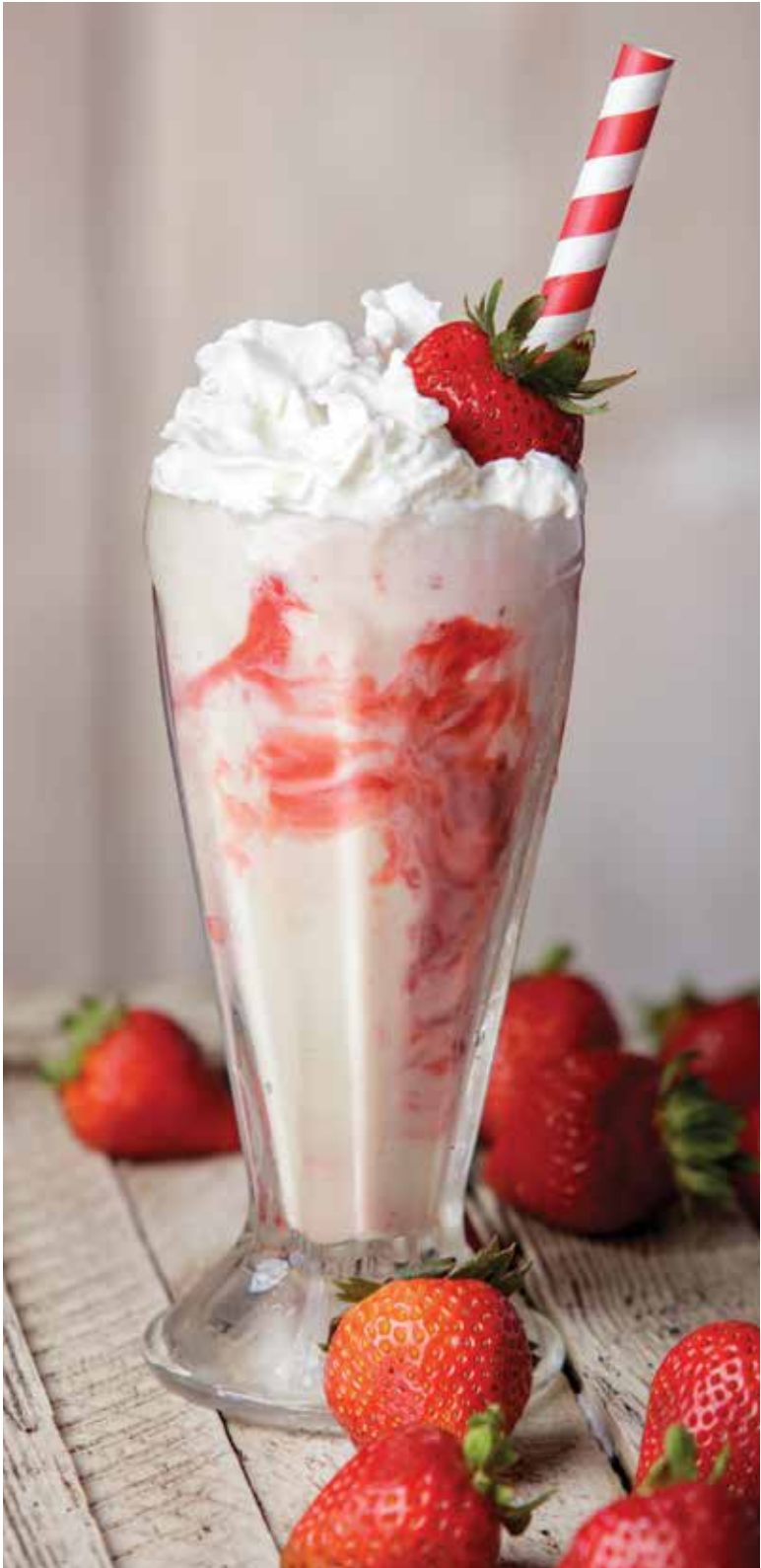
8.5" Striped Red/White Milkshake Straw