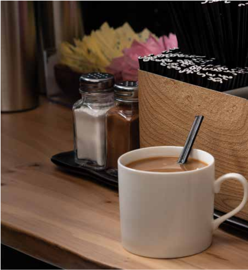
5" Black Coffee Stir Stick

Great for hot or cold beverages. Great for mixing drinks such as coffee, tea, mixed drinks, cocktails, hot chocolate, etc. Perfect for restaurants, bar supply, coffee shops, concession stands, schools or officer break rooms