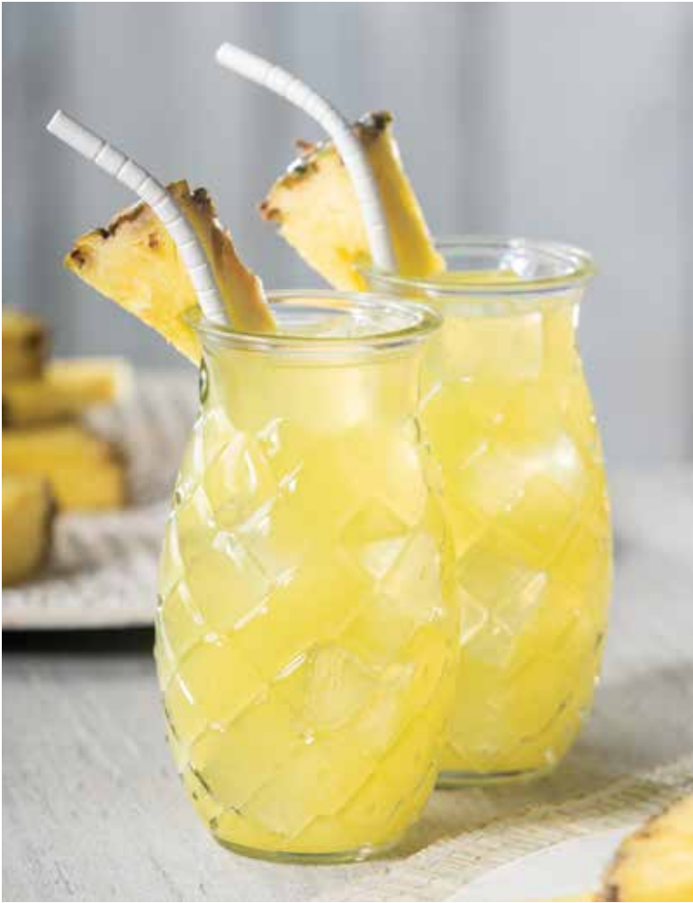
7.75" White Flex Straw