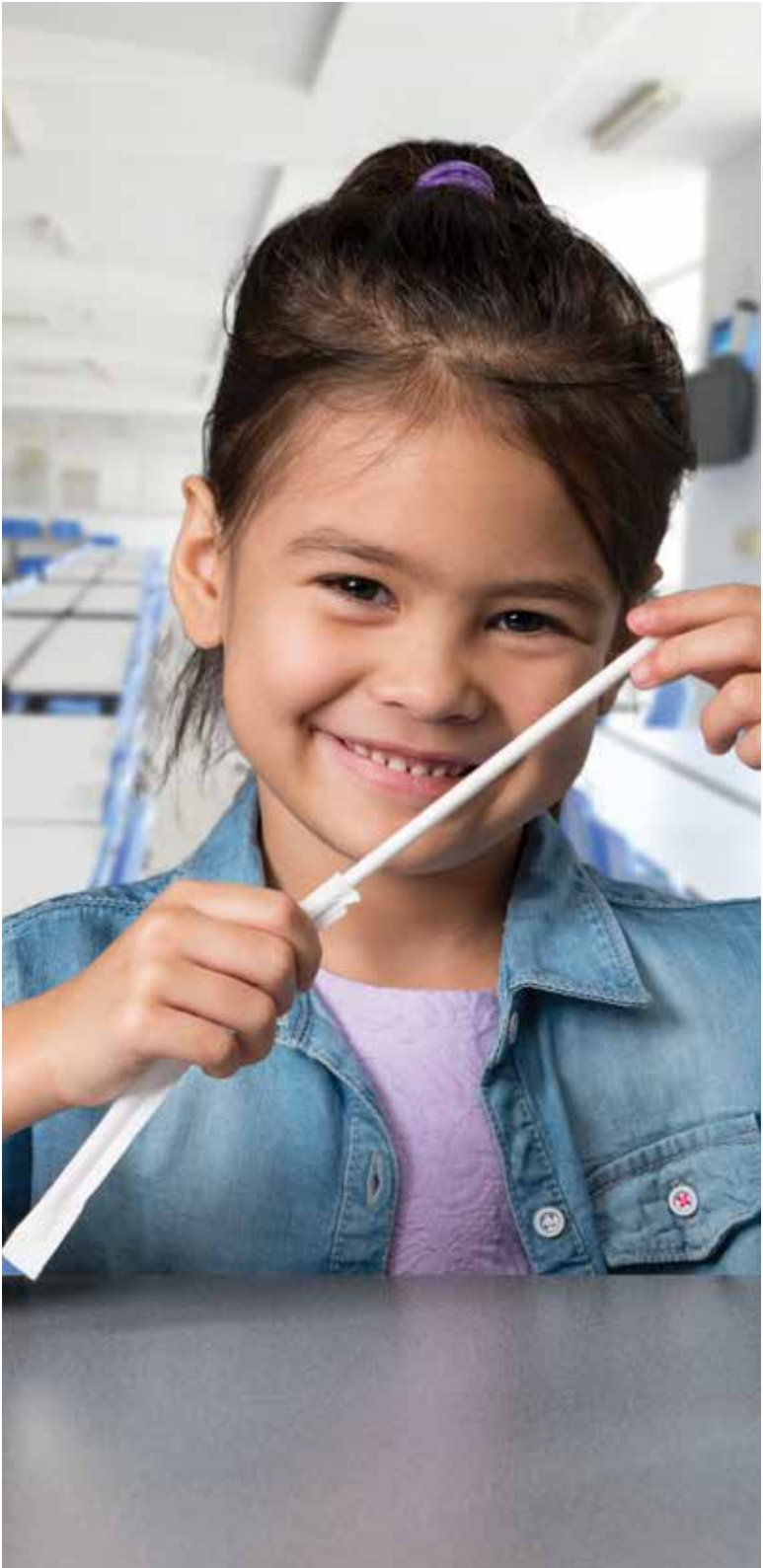
5.75" White Milk Straw