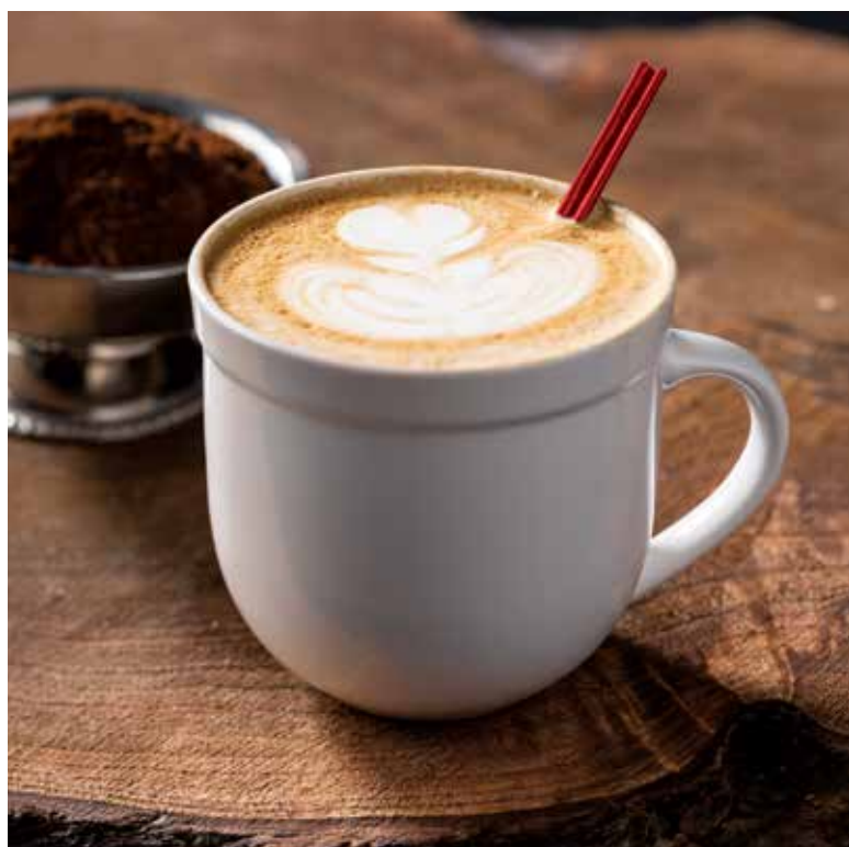
5" Red Coffee Stir Stick