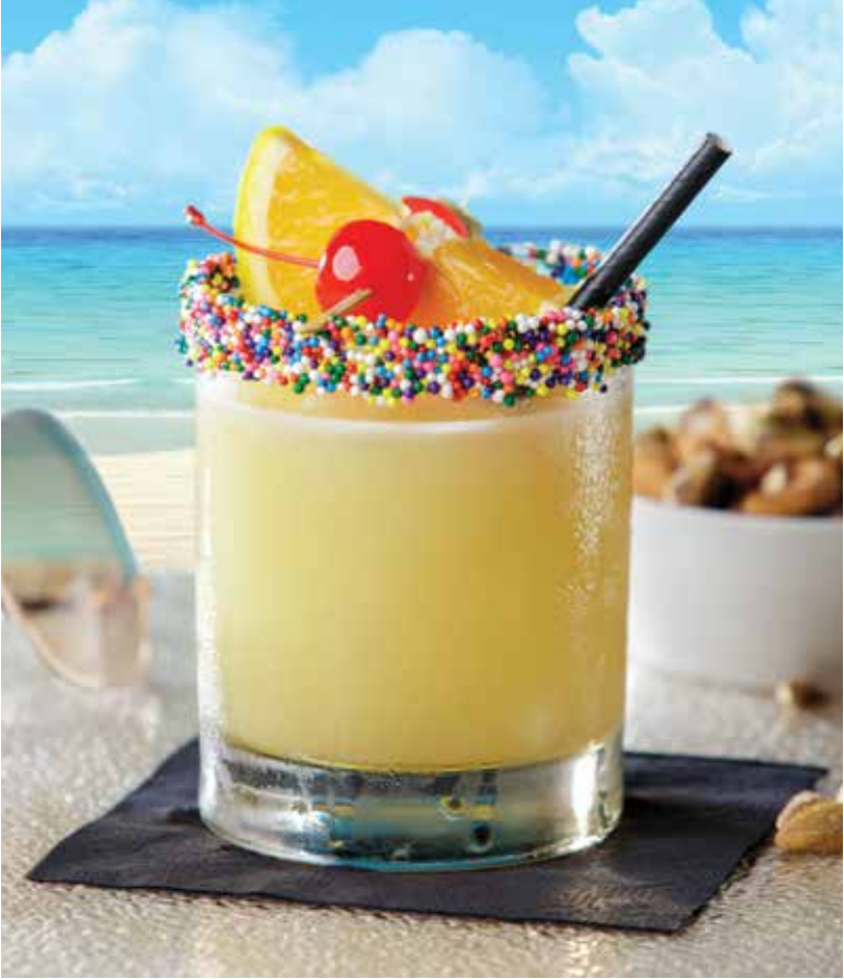
5.5" Black Cocktail Straw