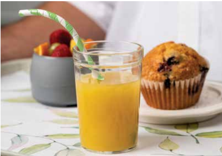
7.75" Striped Green Flex Straw