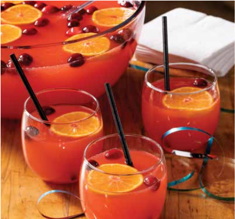
5.75" Black Bar Stir