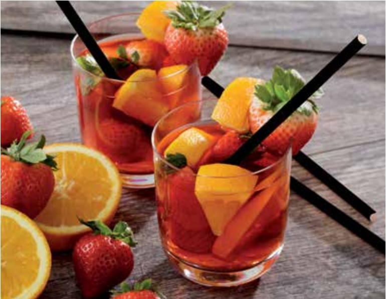
5.5" Black Cocktail Straw