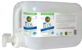
ECOS® Magnolia and Lily 5 Gallon Deltangular