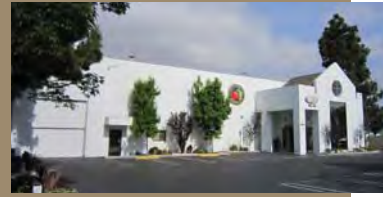
GARDEN GROVE, CA