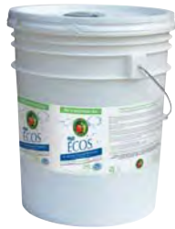
ECOS® Free and Clear 5 Gallon pail