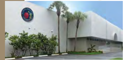
OPA LOCKA, FL