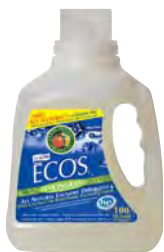
ECOS® Lemongrass 100 oz. bottle

PL9756/08 8 pk - 50 oz retail PL9890/04 4 pk - 100 oz retail PL9373/02 2 pk - 170 oz retail PL9756/04 4 pk - gallon PL9756/05 5 gallon pail PL9756/05U 5 gallon deltangular PL9756/55 55 gallon drum