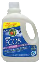
ECOS® Lavender 170 oz. bottle

Unlike top-loading machines, front-loading washing machines require the door be completely airtight, once closed. After removing your clean laundry from a front-loading machine, leave the door open and allow the machine to dry out. If you close the door immediately after using, the interior of the machine is still moist and airtight, which will cause mold and mildew growth inside your machine. For best results use ECOS® and leave the door open to dry out after use.