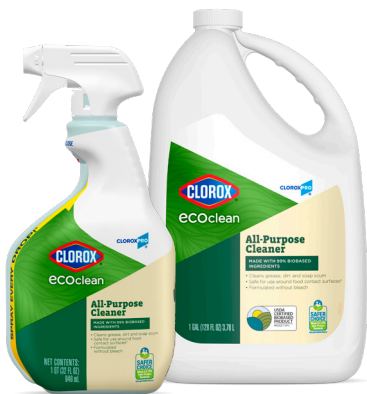
9/32 oz. Spray, Case UPC: 60276 4/128 oz. Spray, Case UPC: 60278