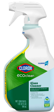
9/32 oz. Spray, Case UPC: 60277