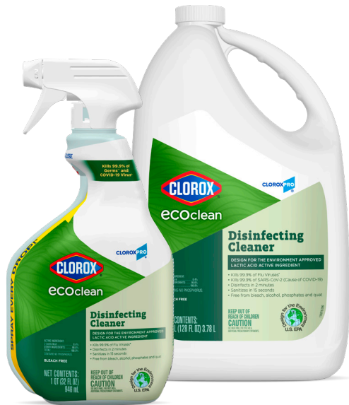
9/32 oz. Spray, Case UPC: 60213 4/128 oz. Refill, Case UPC: 60094

More sustainable cleaners and disinfectants that help keep facilities clean and healthy while using EPA Safer Choice and Design for Environment approved ingredients.