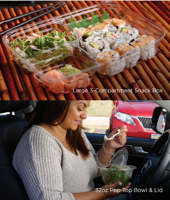
Large 3-Compartment Snack Box

Consumers have challenges eating in small spaces and standing up while dining at bus stops, train stations and airport terminals. Sabert Pop Top Bowls & Snack Boxes can increase your mobile consumer sales by making it easier for them to dine while in transit. Operators who use these products for their meals can benefit from new loyal mobile guests who travel to work or school everyday.