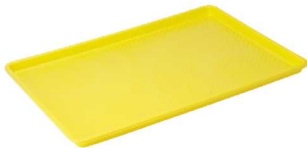
Disinfecting Tray Item# TRY-YLW