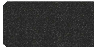
3'x5' Step-Off Runner Item# RUN-3X5