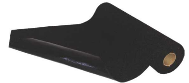
3'x25' Runner Mat Item# RUN-36